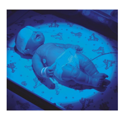
Excellent light uniformity and large spot size combined with the right intensity result in effective patient dosage.