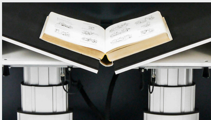
Scanning a book using the protective V cradle for fragile bound documents.

Together with software packages such as Batch Scan Wizard, BCS-2® and Goobi UCC, even the toughest requirements of a digitization project can be met.