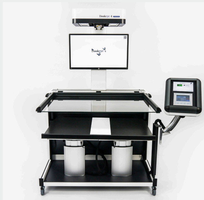
Motorized book cradle at 35cm height