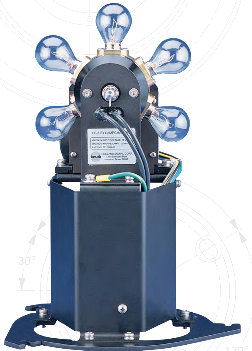
LC-6 Ex Lampchanger